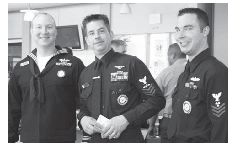
taken during the 2008 NCW Career and Job Fair.